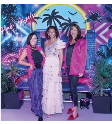
29th Annual Conine All-Star Golf Classic | 7th Annual Adaptive Sports Bowl-A-Thon | 19th Annual Diamond Angels Fairy Tale Ball Chop Challenge Food & Wine Festival | Catch the Love Golf Classic | Touch of Pink Party