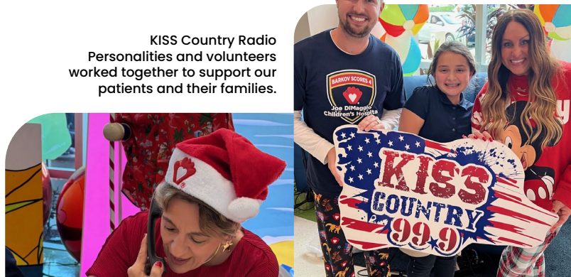
KISS Country Radio Personalities and volunteers worked together to support our patients and their families.

Through the unwavering support of the South Florida community, the event stands as a testament to what can be achieved when people come together with a shared purpose: improving the lives of children and families.