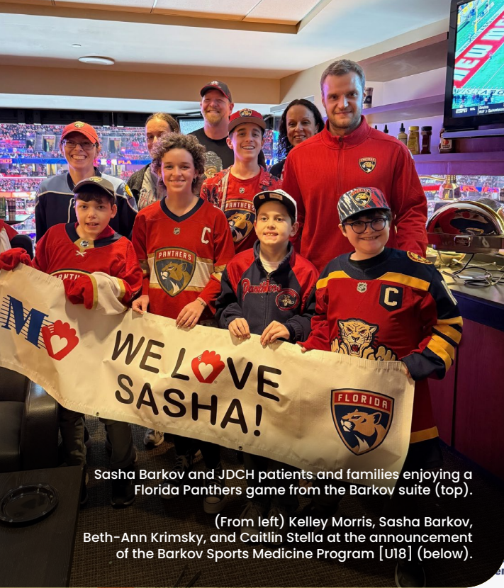
Sasha Barkov and JDCH patients and families enjoying a Florida Panthers game from the Barkov suite (top).